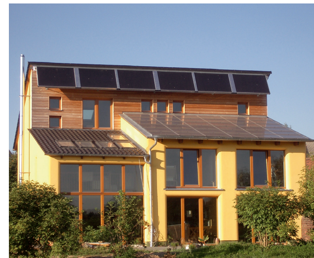
PASSIVE HOUSE in Grimma local center Schkortitz

Update a methodological guide about energy efficiency in building and renovation, create 2 different welcoming guides for tenants: one for efficient building and one for non efficient buildings.