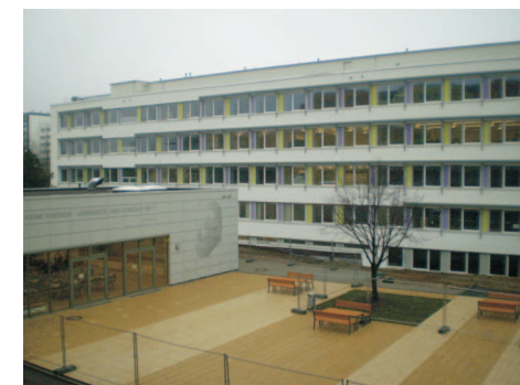
Passive house school – Wilhelm-Ostwald-Gymnasium, Leipzig