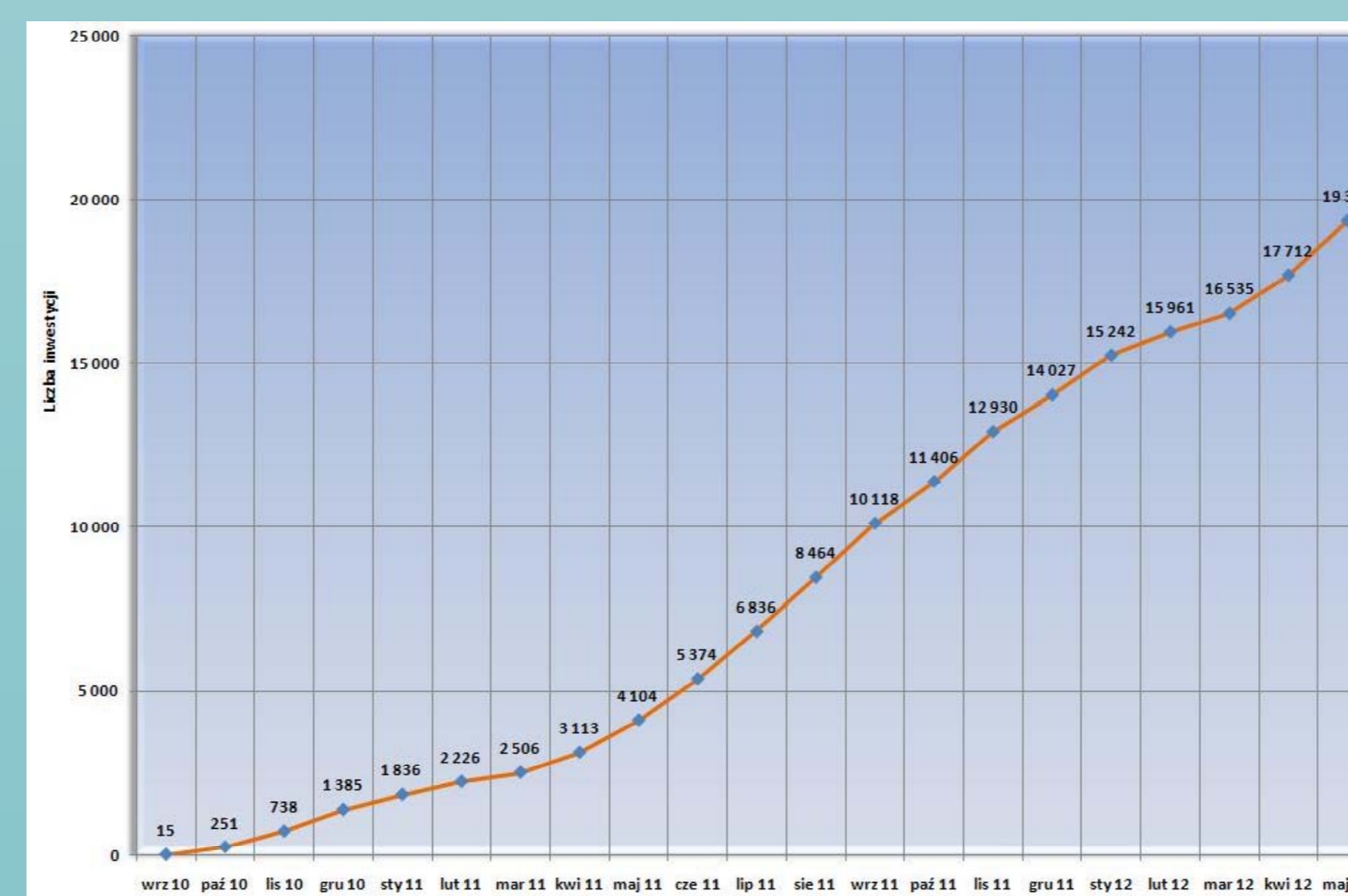
Fig. 2 – Solar thermal panel incentives: number of applications (total) submitted in Poland